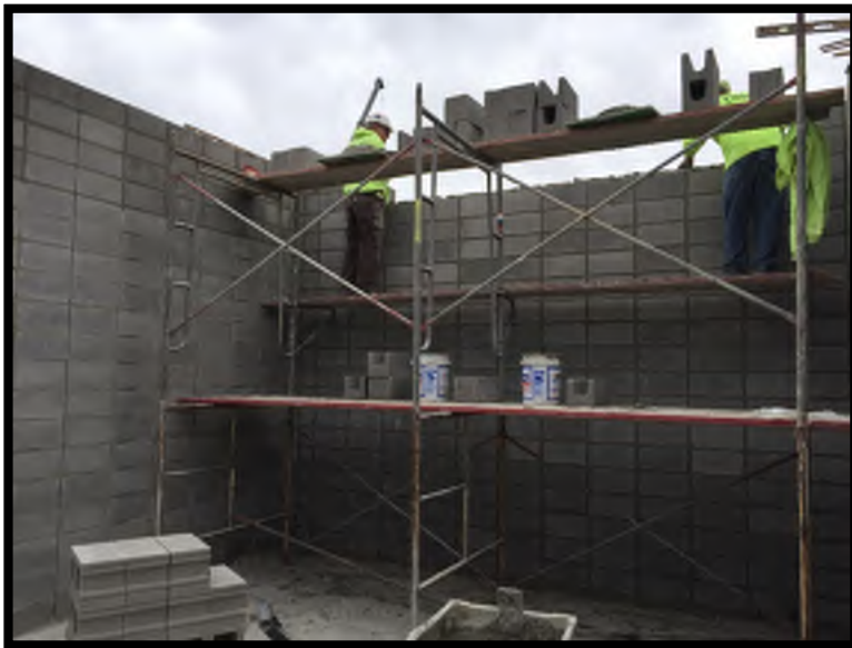
Findorff crew members work on masonry walls for the storage shed.