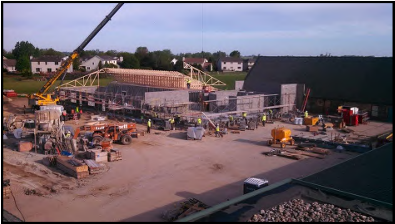
A crane hoists the wood trusses and Findorff Carpenters set them in place!