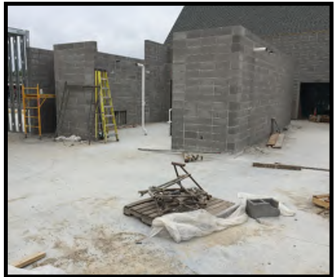
Walls set in place by the Findorff bricklayers.