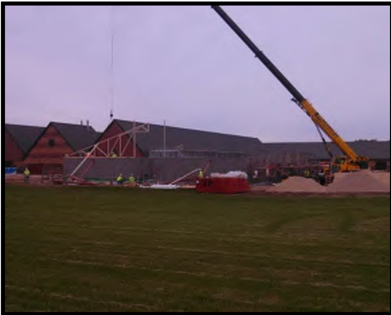
Setting the first truss in place for the new addition.