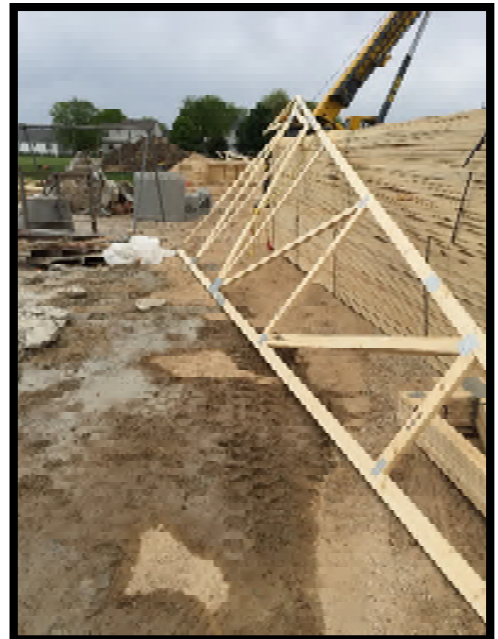
Trusses ready to be hoisted and set.