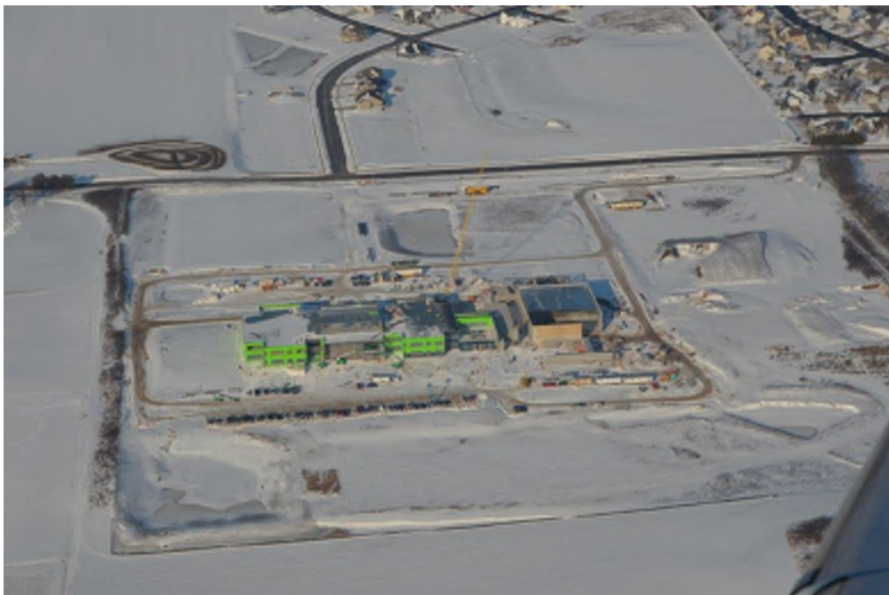
Aerial shot of the jobsite looking north