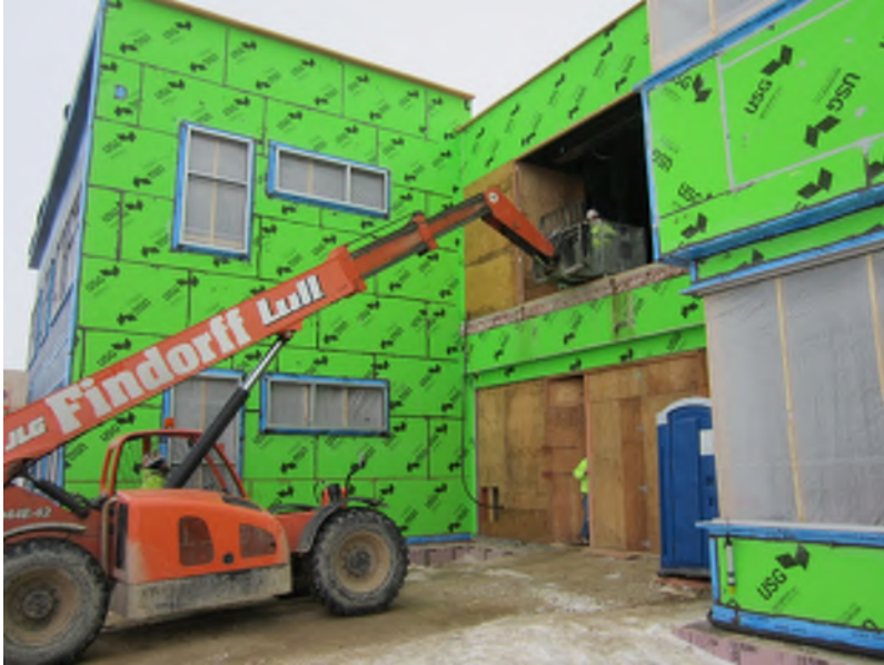
Transferring supplies and equipment to the second floor with this reach forklift.