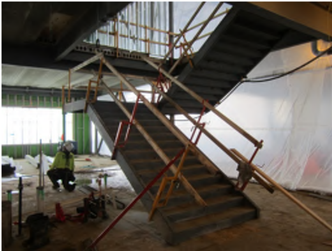
Stairs in Area B were poured Tuesday and are functional for use.