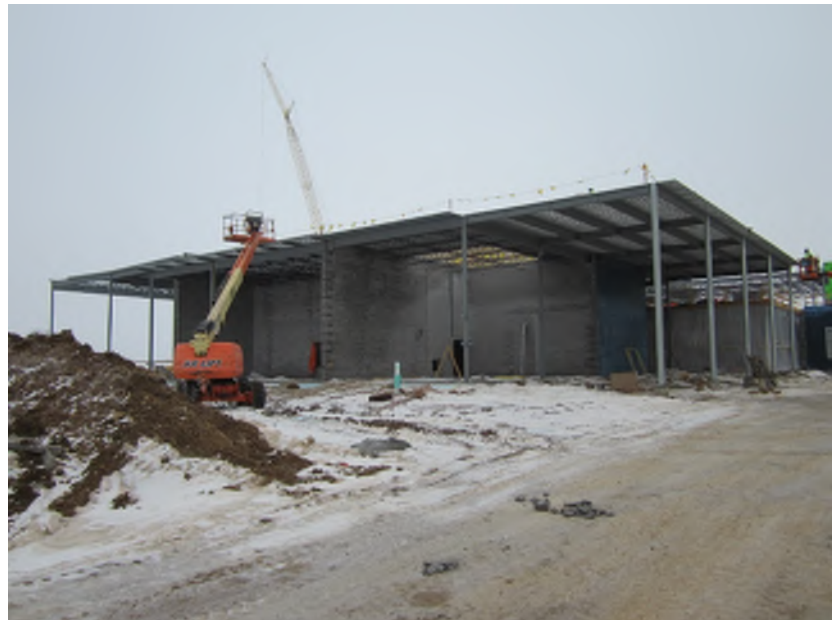
Decking over choral and general music rooms in area C is currently being installed.