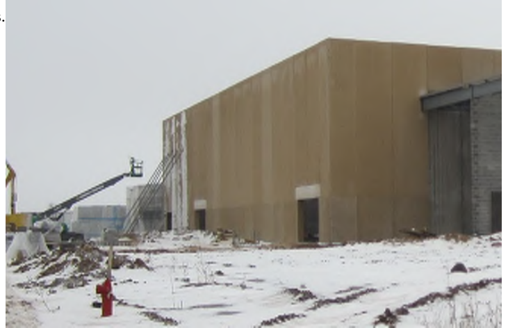
The last of the precast panels being installed at the Southeast corner of the gym.