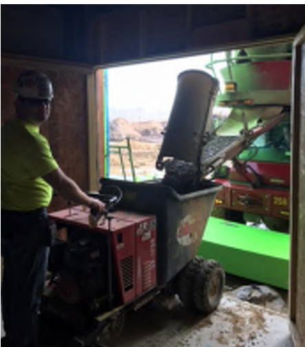
More concrete pours in Area C