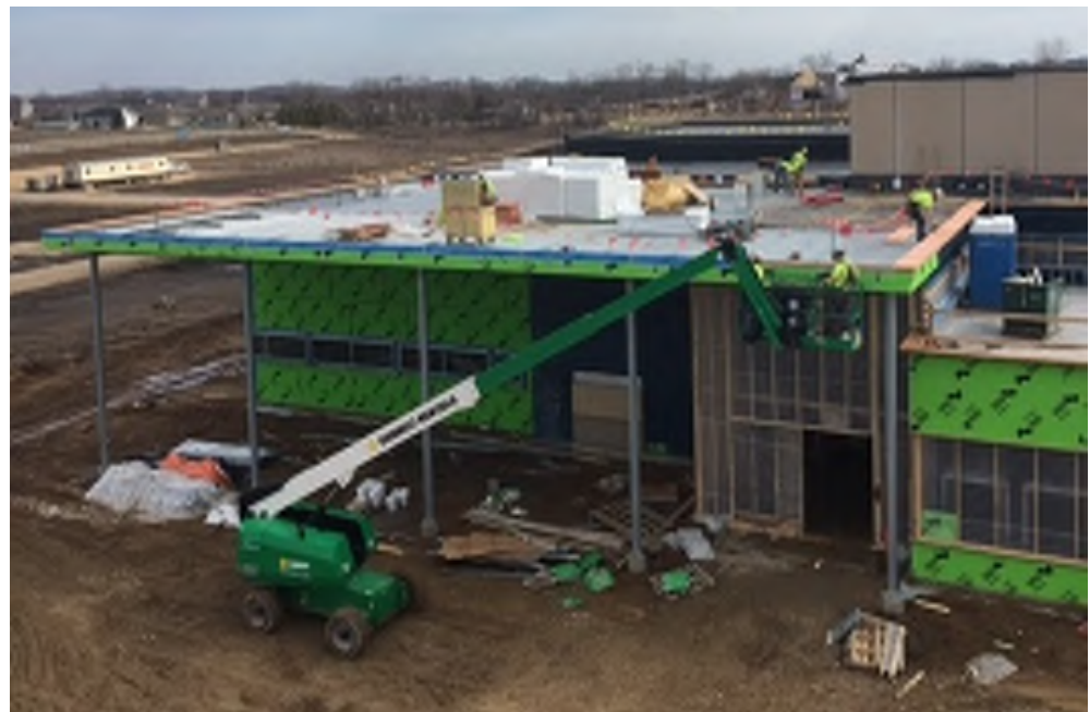
Roof blocking and waterproofing over Area C - Music