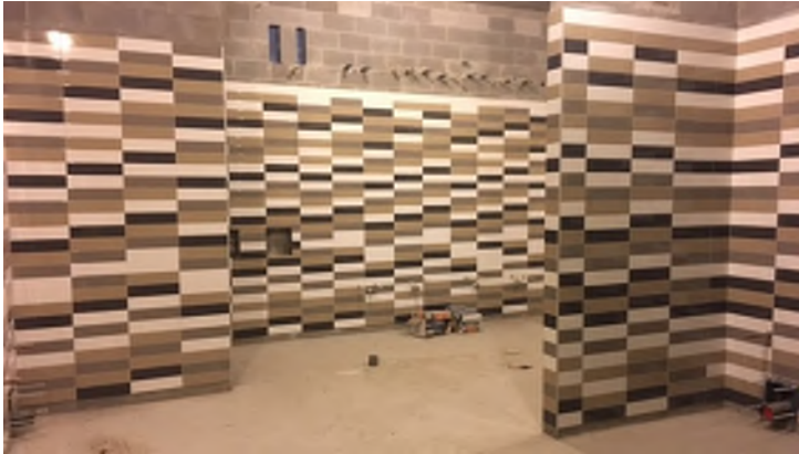
Ceramic Tiling in Area D Restrooms