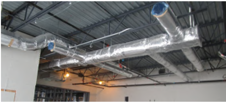
Insulated HVAC ductwork in Area 2A