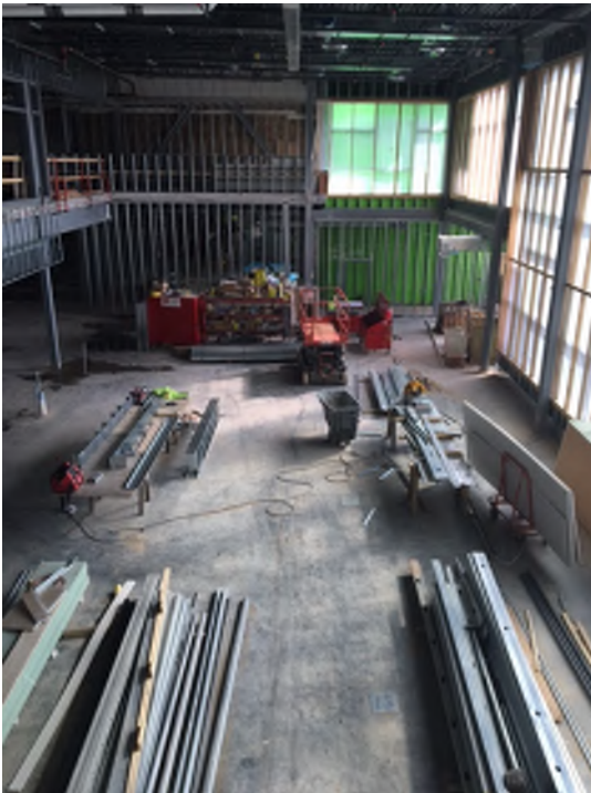
The library has temporarily become a storage place for steel beams and drywall.