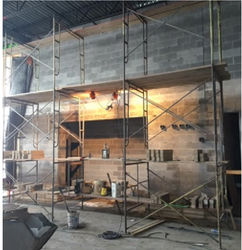
Cast stone placement in Area C alcove.