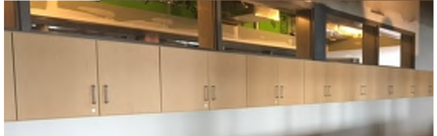
Casework installation begins in the 2B Collaboration Area