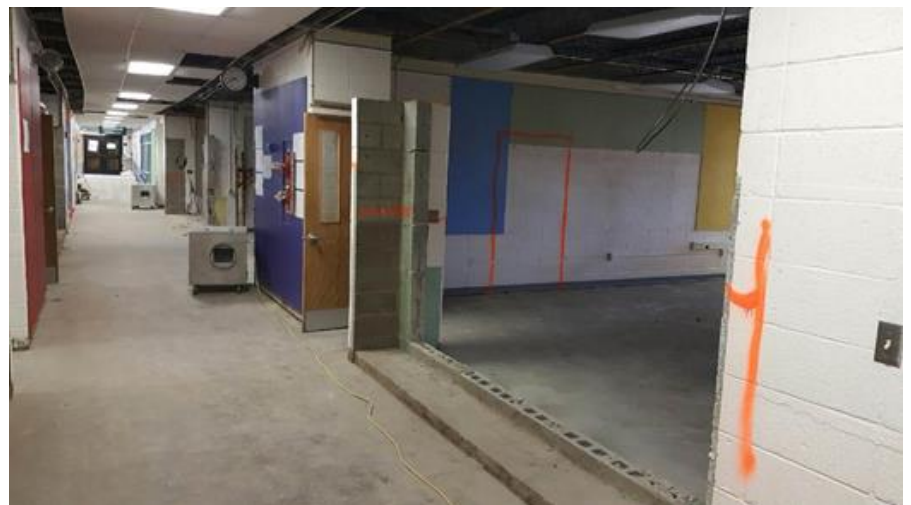
These three walls have been demolished in preparation for the new room layout.