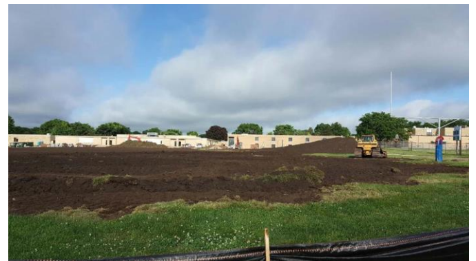
Excavators are hard at work on the athletic field!