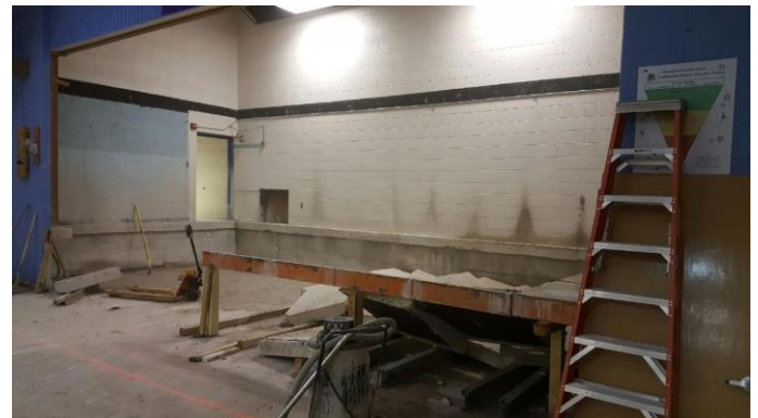
The stage in the gym has been completely demolished and removed, now work can begin to transform this area into a multipurpose space!