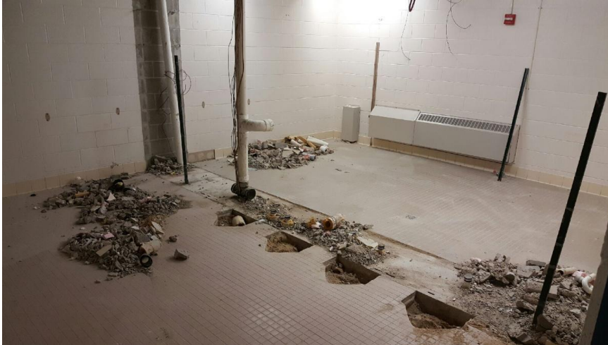
All the fixtures and the wet wall have been demolished, the area is now ready for updated restrooms.