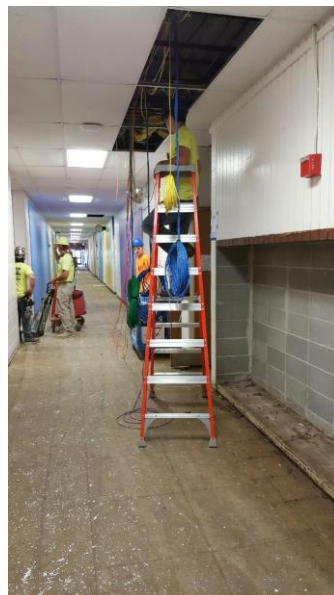
Globalcom is getting all the low voltage cabling pulled through the ceiling.