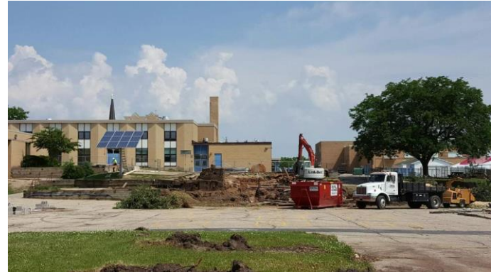
Exterior demolition is really making progress on the playground area.