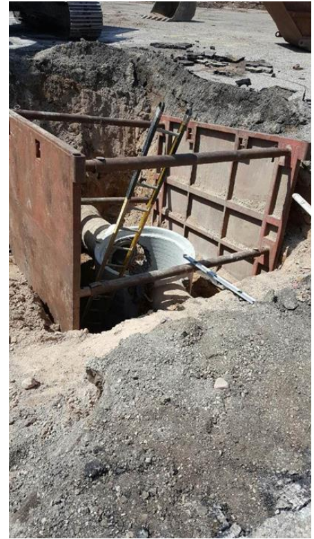
One of the many drain structures that will be set behind the school.