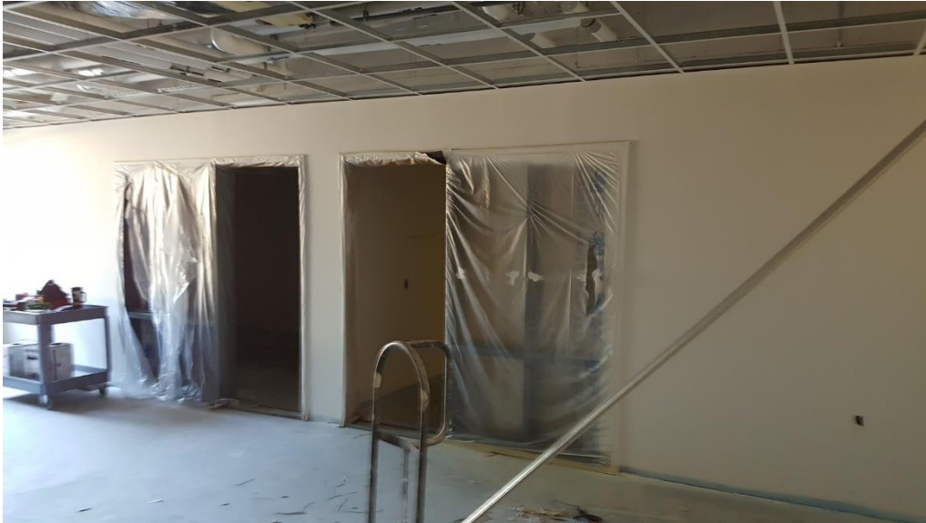
Another wall that is being painted. The painters always make sure that they carefully apply plastic over areas that cannot get paint on them, like the new door frame in the above picture.