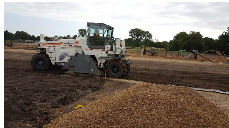
This piece of equipment is an asphalt pulverizer. It scrapes up the old asphalt surface and pulverizes it into small aggregate. It then lays this aggregate down behind it!