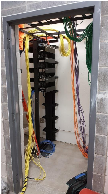
Equipment racks are being installed in the data closets. There is a lot of cable already in the room and that is not even all of it!