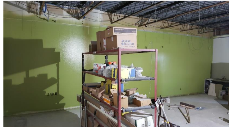
Here is a sneak peak at one of the various colors of paint. Can you guess which room this is in?