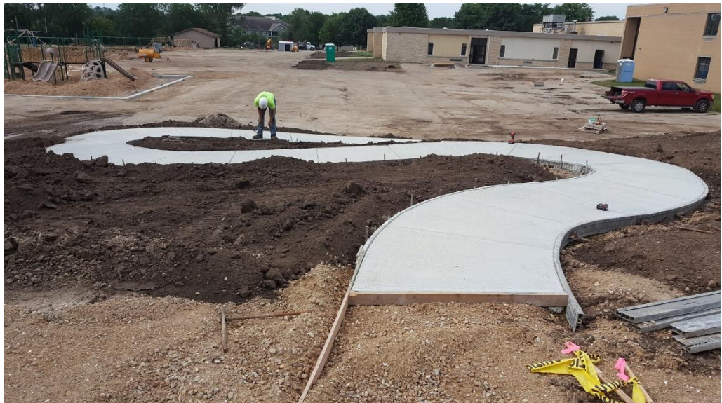
The new sidewalk above the retaining wall is all poured. Now it is time to get the railing in place.