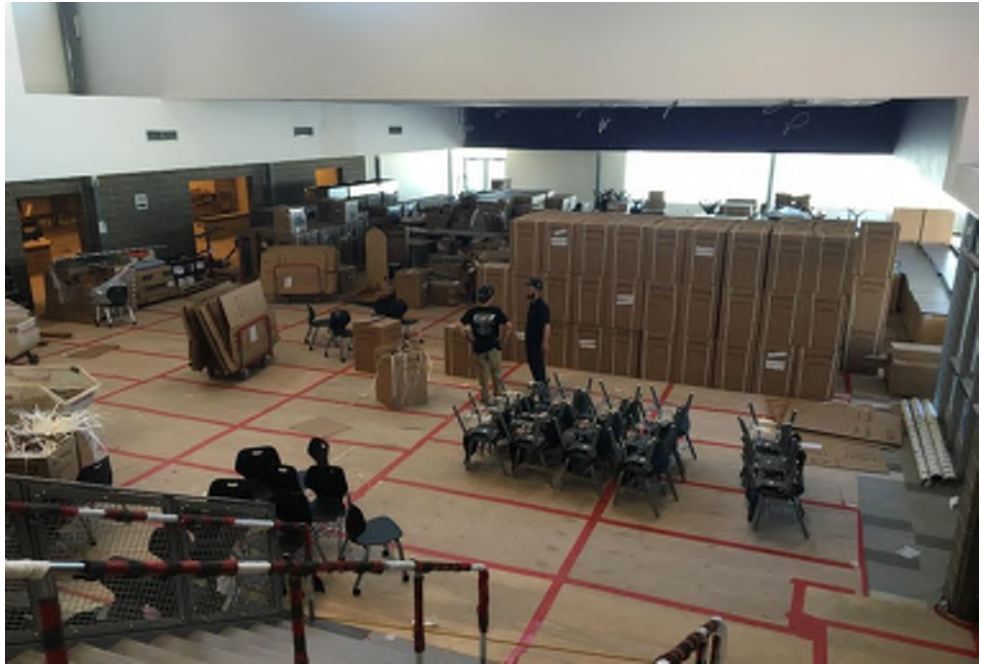
The furniture is staged in the cafeteria and then is distributed throughout the building.