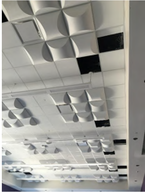
Ceiling mounted diffuser tiles were installed in the music rooms to enhance its acoustics.