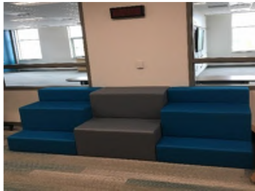
Typical class rooms here (Left/Right); plus, examples of the furniture found in the collaboration areas (above)