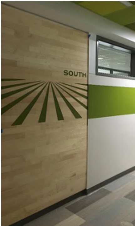
Wood panels distinguishing the different Villages – green is the “Earth” Village