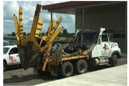
This machine is used to transplant young trees without damaging their roots.