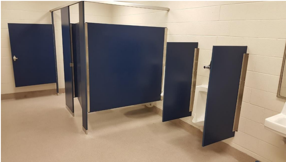
The bathrooms now have new toilet partitions and are ready for use!