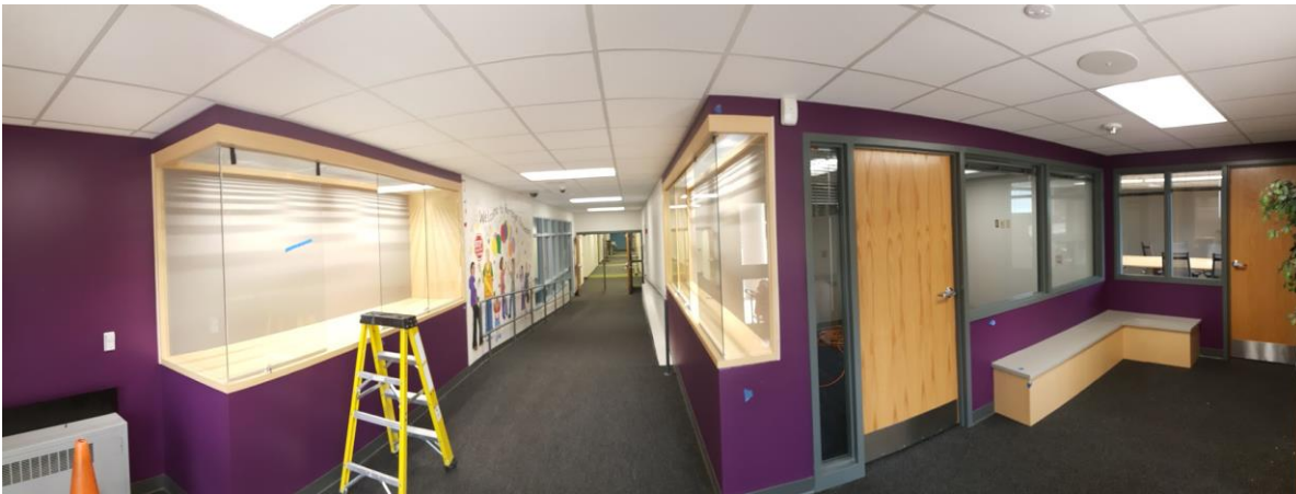
Here is what the main entrance of the school will look like when you walk in. It has changed a lot since the beginning of summer!