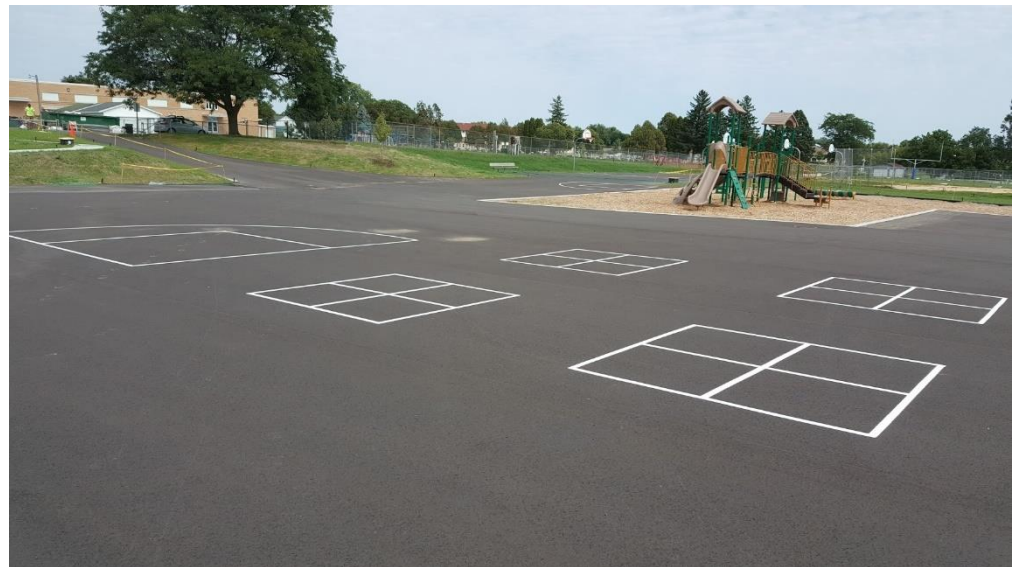
If the basketball hoop isn't your first choice, there is also 4 square, kickball and a few jungle gyms!