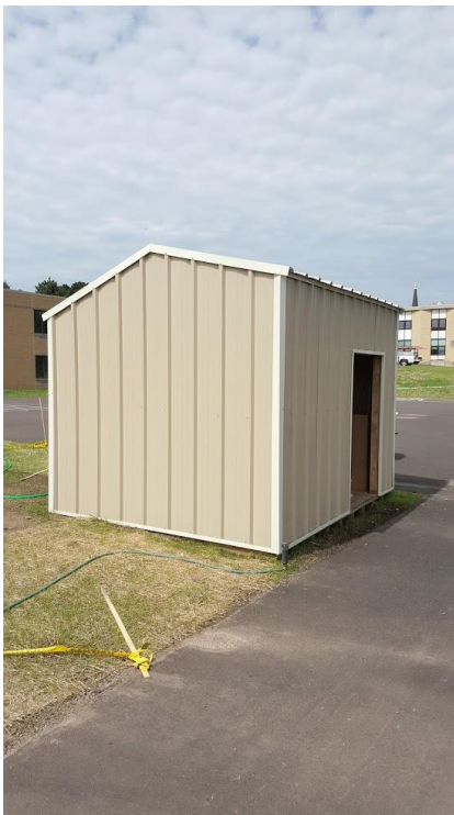
All that's left to do on this metal facilities shed is to add an overhead door and then it is ready to be used.