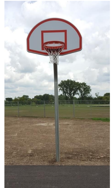
Hopefully Heritage Elementary students like to play outside, because this is just one of the many basketball hoops.