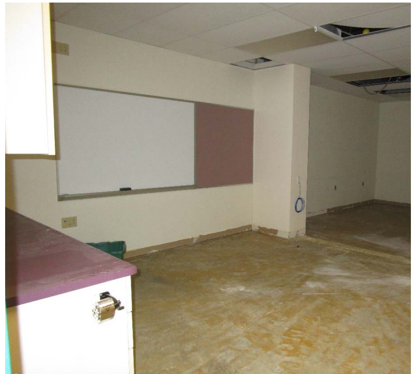
A classroom that has undergone demolition, and will see new flooring.