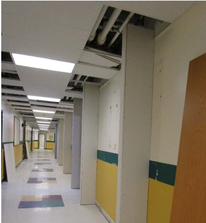
New column bump outs to receive new sections of storage cubbies. This is located in the existing building.