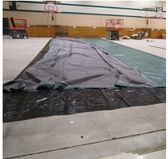
The gym curtain right before it was hung in the gym!