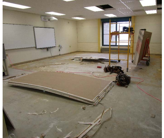
Demolition completed in this classroom, and materials for the renovation are waiting for workers to install.