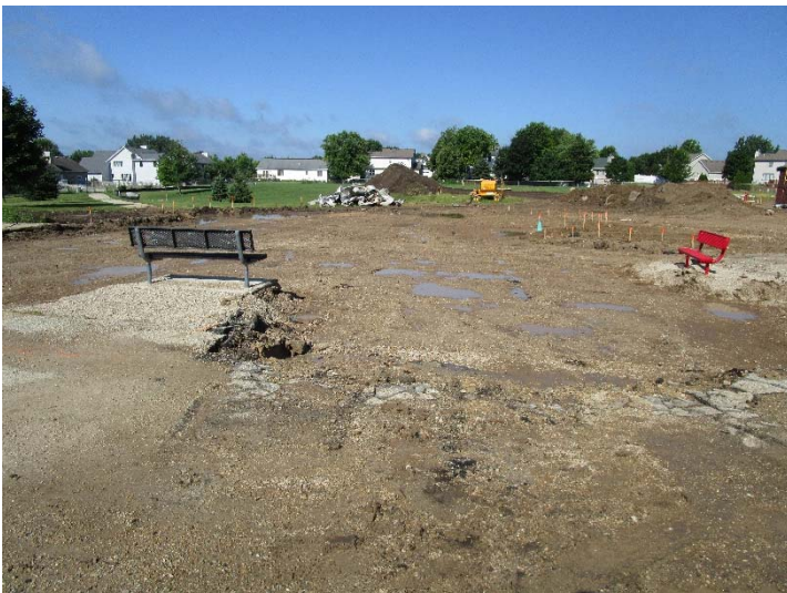
One of the new playground locations for the K-2 side.