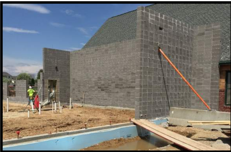
Findorff bricklayers set the first masonry wall this week!