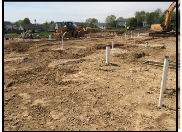
Monona Plumbing finished their underground plumbing "rough-ins".