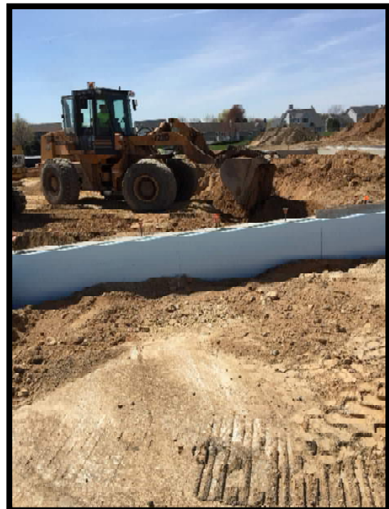
Dane County Contracting backfills the new addition.