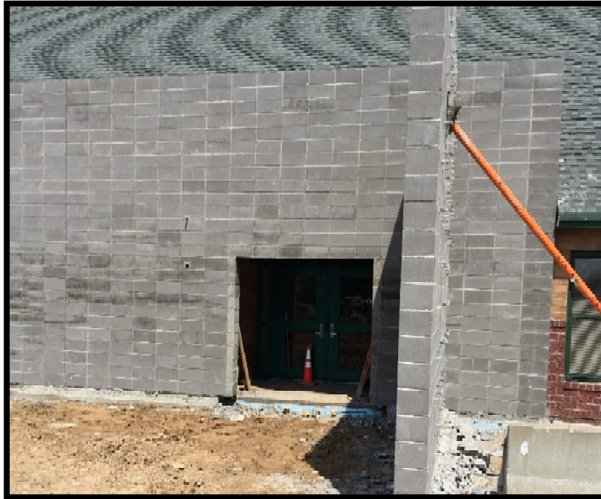
The connection from Prairie Elementary to its new addition!