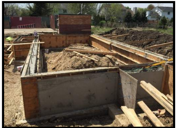
Foundation walls and forms for the new storage building.