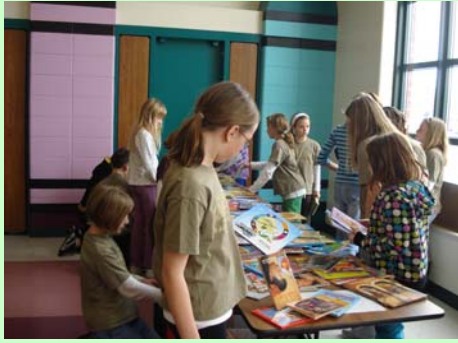
Read Across America Book Exchange