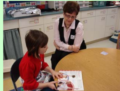
State Bank of Cross Plains Partners in Education