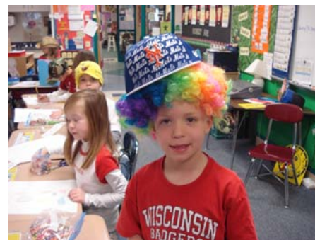
Wear your favorite Hat Day!