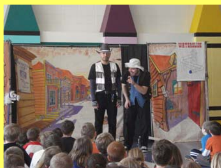
Conservation Canyon Program