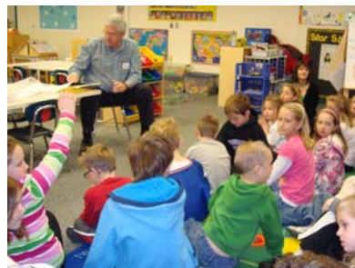
Adopt a classroom Uniek Inc.