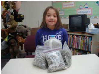
Pop tabs for Ronald Mc Donald House