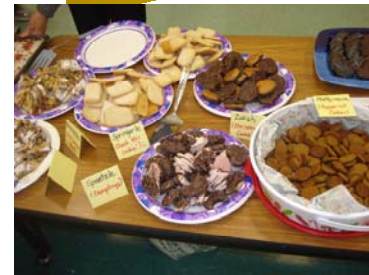
Holidays around the World!