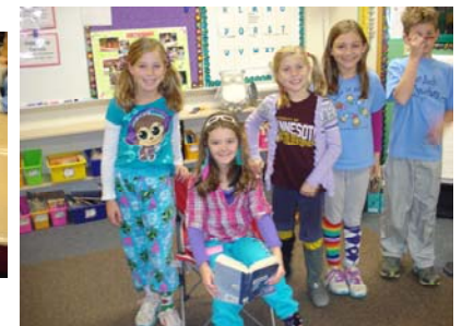
Mix It Up Day