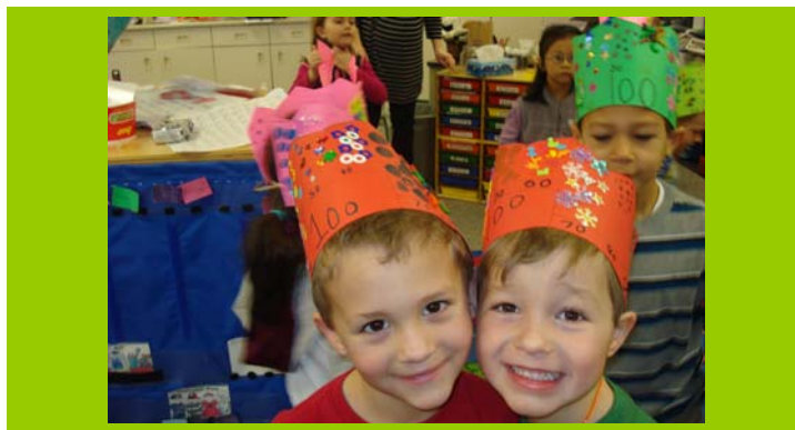
100 Days of School

Mark your calendars for March 22 – 6:00-7:40 p.m. for our Prairie Family Learning Night! This is a great opportunity for Prairie families to enjoy each other while learning something new. More information will be sent in Thursday, folders. This is a free night of great opportunities for the whole family.