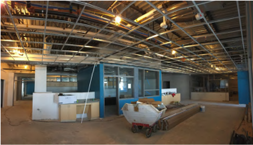
A typical 'Village' collaboration space. Acoustical ceiling grid installed