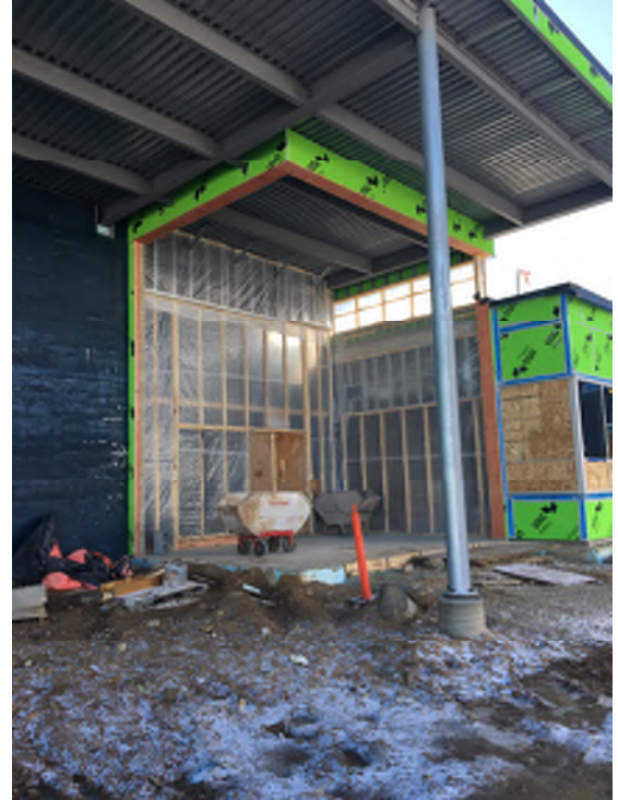
The front entry to the building – curtainwall and glass will be set next week