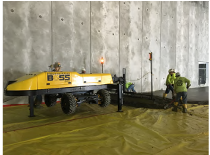
Trying new technology – Findorff concrete crew trying out a new power laser screed to finish the concrete.