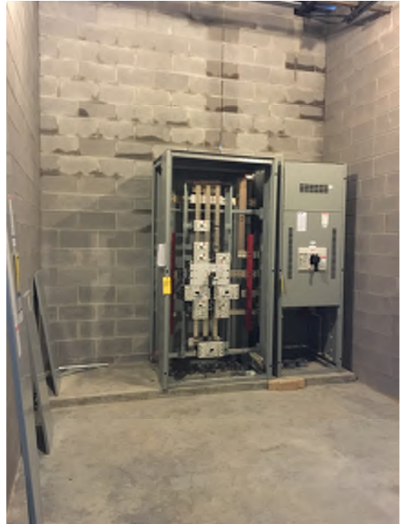
Setting switchgear in preparation for permanent power.