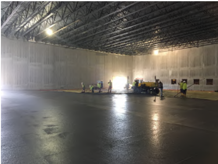
Speaking of March Madness, we are getting ready for basketball courts, the slab on grade was poured today