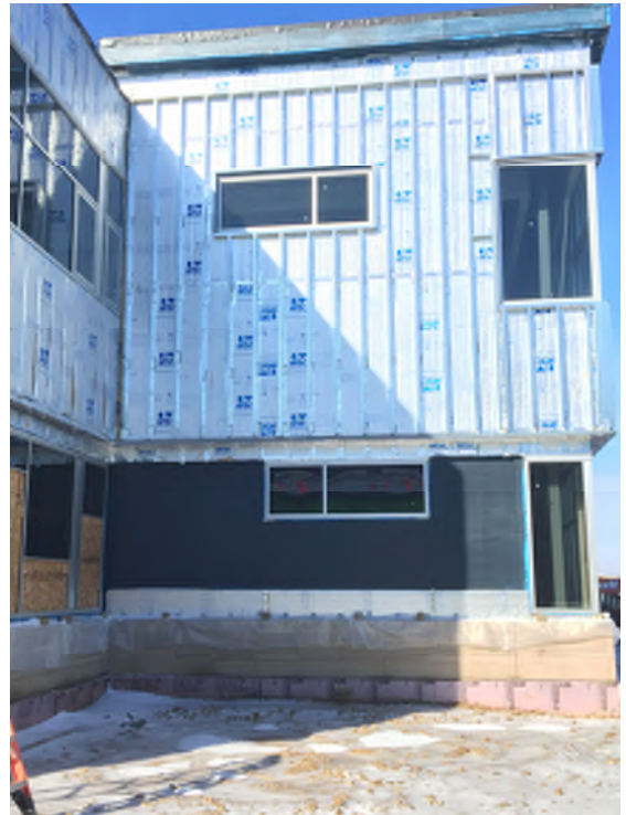
We are headed back outside, cast stone being set on the exterior of the building