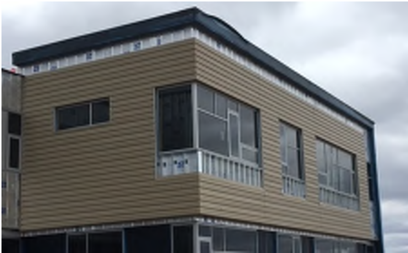
Metal Panels on 2 nd floor Area A North.