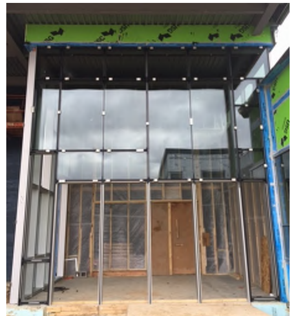
The front entry to the building with newly set curtainwall and glass.