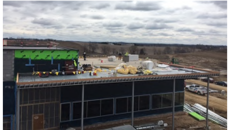
Roofers finishing up over the Cafeteria.