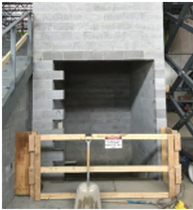
Elevator is ready for install!