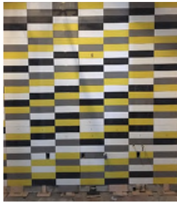
New wall tile color!