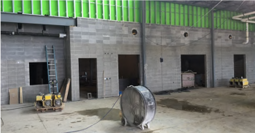
The overhead doors in the kitchen area will be motorized and coil up behind the door opening.