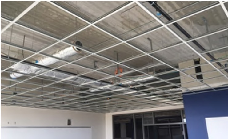
Before installing the ceiling grid (shown above) we make sure that all the large, above ceiling systems are in place.