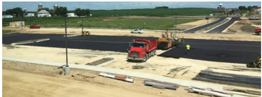
Blacktop for the main parking lot on the North side of the building