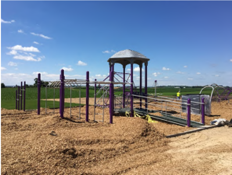
I don't know about you, but I think this playground equipment looks like a lot of fun!