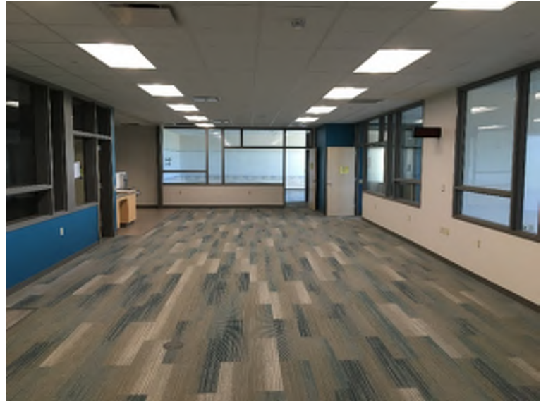
Now that final cleaning is complete, 2 nd floor Area B is ready for furniture!