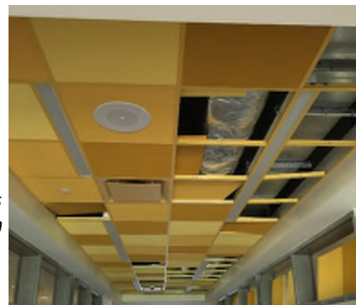
Multiple different shades of yellow ceiling tile in the 2A corridor indicate that you are in the Sun themed classroom Village