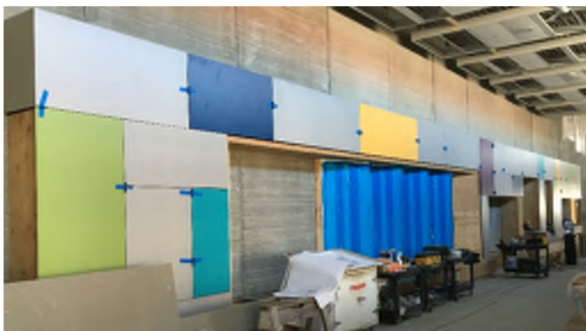
A very colorful display case lines the school's main corridor. (left)