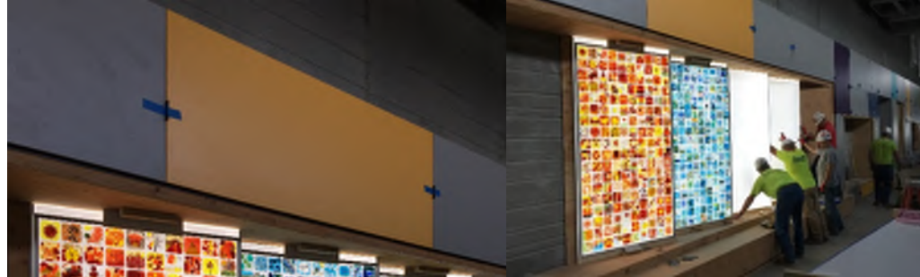
Colorful, LED backlit art glass tiles mounted in the display case will brighten up the main corridor.